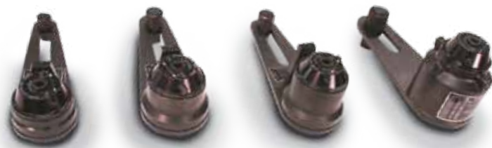
395 Not Pictured

The Sweeney brand of reaction plate multipliers from Hydratight offer high torque ratios and reaction anchors to adjacent sockets. Custom designs are also available.