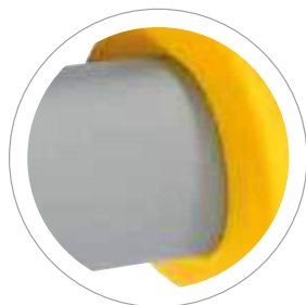
Rigid and lightweight

Single-handed adjustment of the dies for left and right handed users